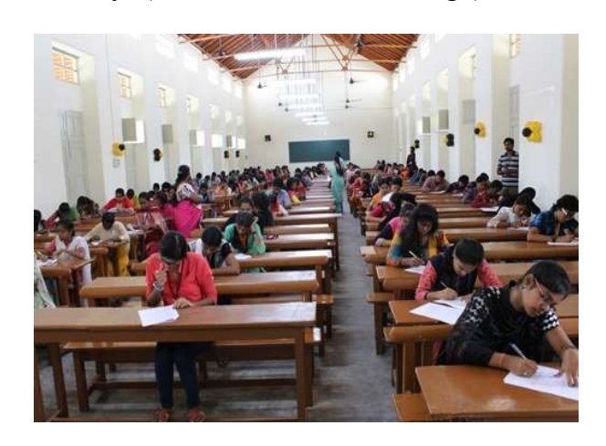
VENUE: Quinn Hall