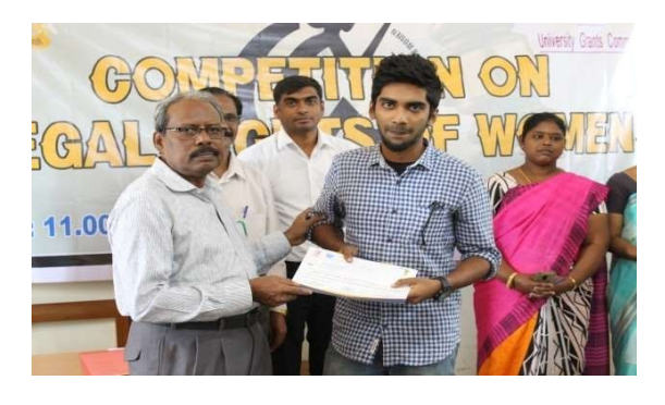
FIRST PRIZE WINNER