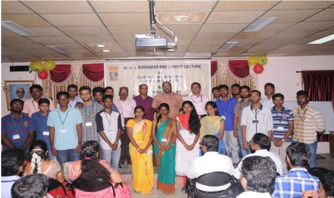
The winners of Istoría'16 (Madras Christian College) with the chief guest