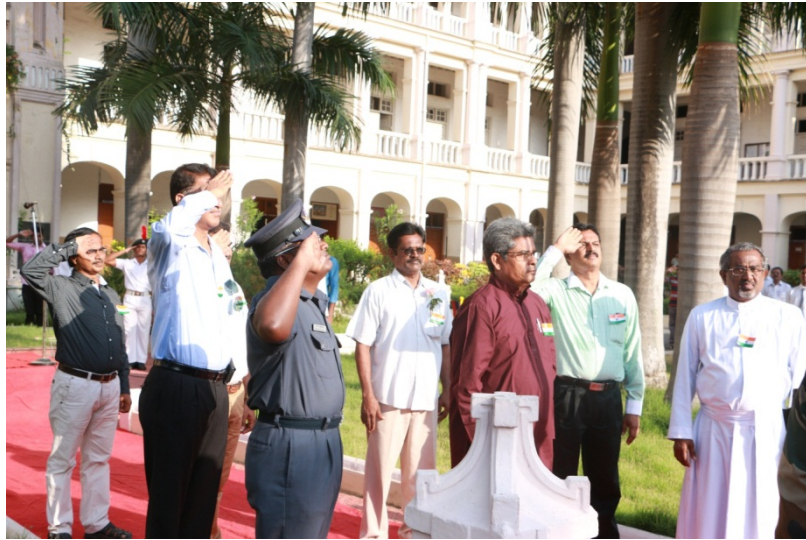
Independence Day 2015