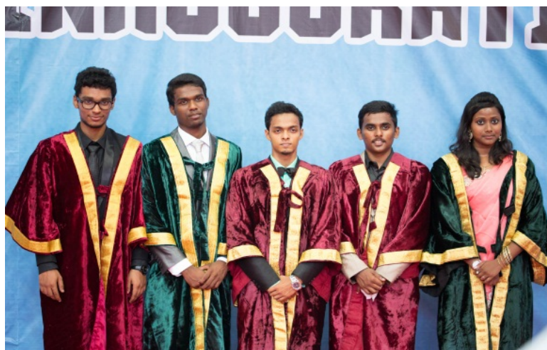
The Elected Team of LSU 2015-16

For the first time a differently abled person was nominated as the Special Secretary in the Union.