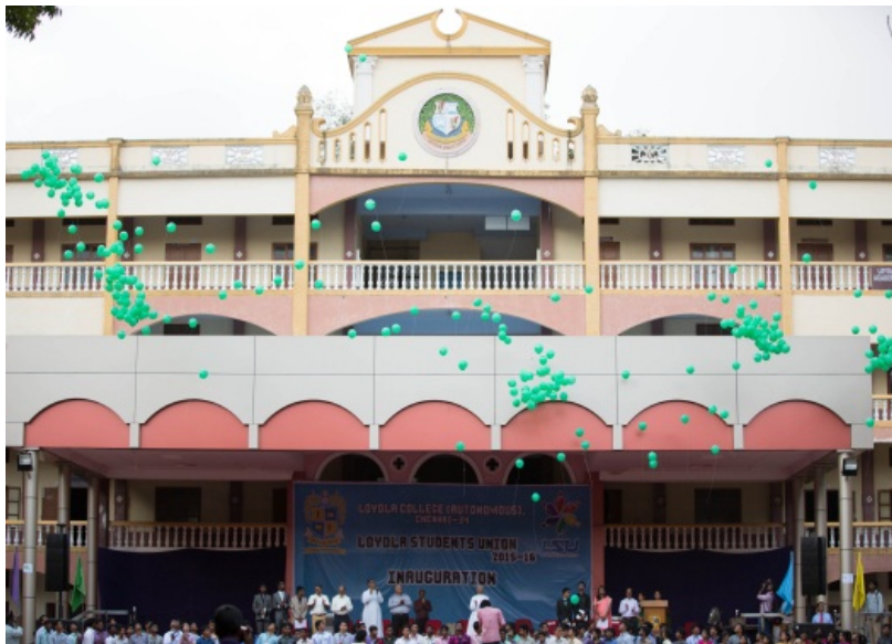
Inauguration of LSU & Green Loyola