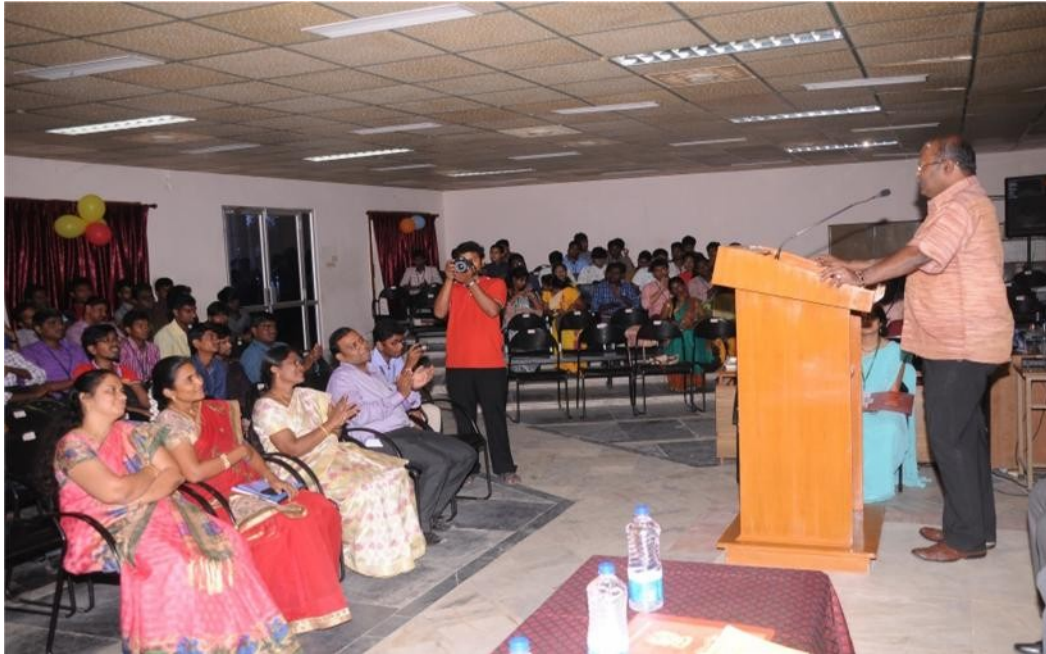
The audience hearing the lecture

The Chief guest then moved to another monumental judgement on Maneka Gandhi Vs Union of India, 1978 which held that Section 10(3)(c) of the Passport Act confers vague and undefined power on the passport authorities, it is violative of Article 14 of the Constitution since it doesn't provide for an opportunity for the aggrieved party to be heard. It was also violative of Article 21 since it encroached upon personal liberty and security to privacy. The speaker also condemned the move of any government in curbing Fundamental Rights.