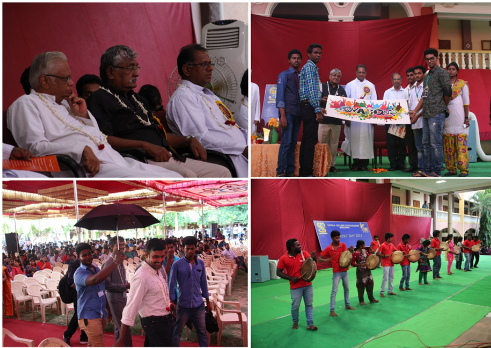
Teachers' Day and Inauguration of Ovations 2015

The celebration of Teachers' Day was combined together with the inauguration of the 24 th edition of India's largest Intra-college festival Ovations 2015 , on September 7 th , 2015.