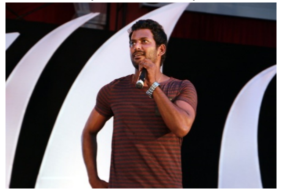
Vishal - Celebrity Guest

A total of 30 on-stage and off-stage events were conducted as part of the festival. For the first time in the history of Ovations , a Fashion Show Competition was introduced which received very good response from students of various departments. A Lazer Show at the end of the first day of Ovations received high acclaim from staff and students.