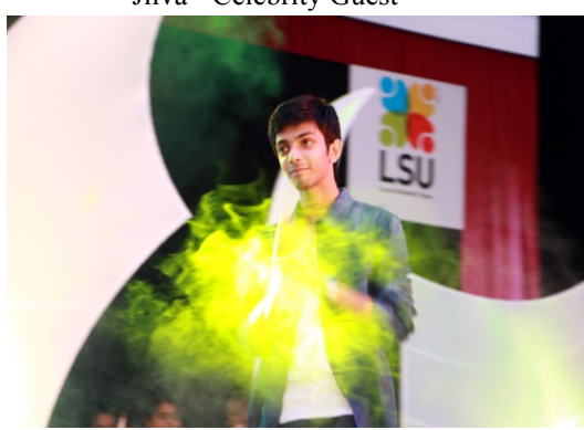
Anirudh - Celebrity Guest