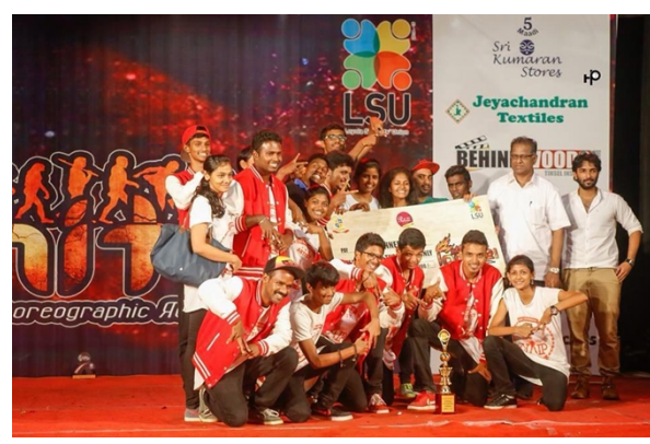
Title Winners - Ignite 2015