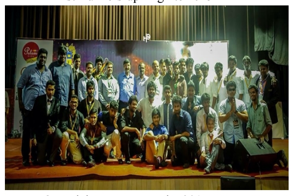
Organizing Team – Ignite 2015

The festival received tremendous response with 12 teams from various colleges competing for a total cash prize of Rs. 65,000. The title winners were the team from SSN College of Engineering and were given a trophy and a cash prize of Rs. 40,000. The first runners-up Womens' Christian College were given a trophy and a cash prize of Rs. 25,000 and the second runners-up MOP Vaishnav College and Sathyabama University were given trophies. The patronage to the event from our students, other college students and the public was overwhelming as was evident from a packed house at Music Academy Auditorium.