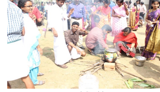
Pongal folk art performance