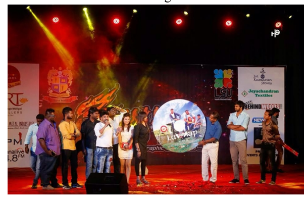
"Aako" Crew on stage