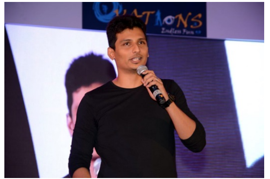
Jiiva - Celebrity Guest