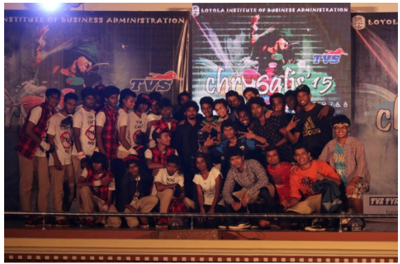
Our Prize winning team in Kalloori Saalai