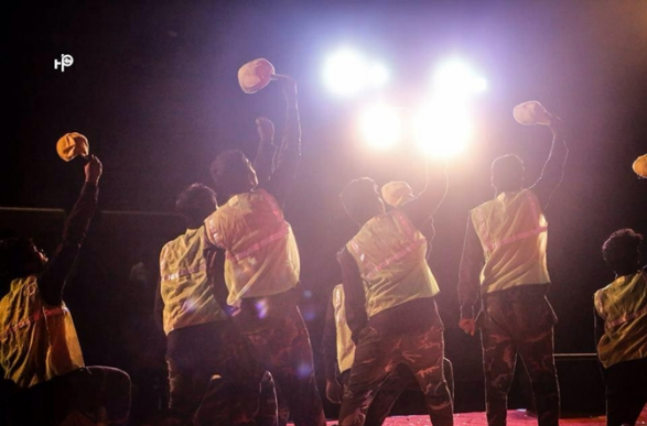
A College Team performing in IGNITE