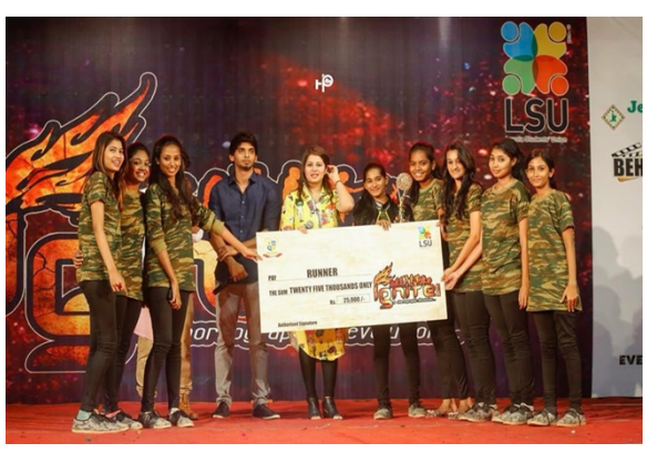
First Runners-up – Ignite 2015