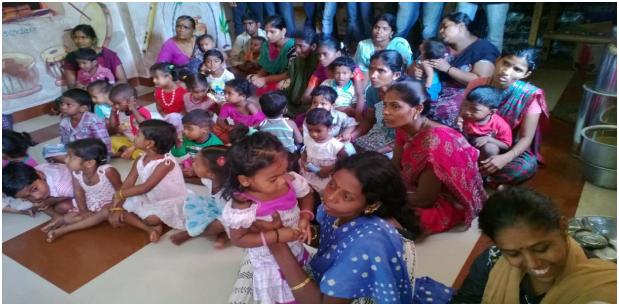
Photo: The children and their mothers. Avoiding processed foods

They told that it's the fault of the parents to make a child get used to eating processed foods. Chips' packets such as Lays contains nitrogen gas, which is extremely detrimental to the health of their children. Maggi contains mono – sodium glutamate, which is harmful for our digestive