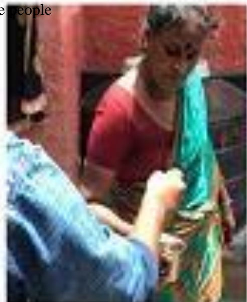
Student Distributed Nilavembu Kashayam to the people