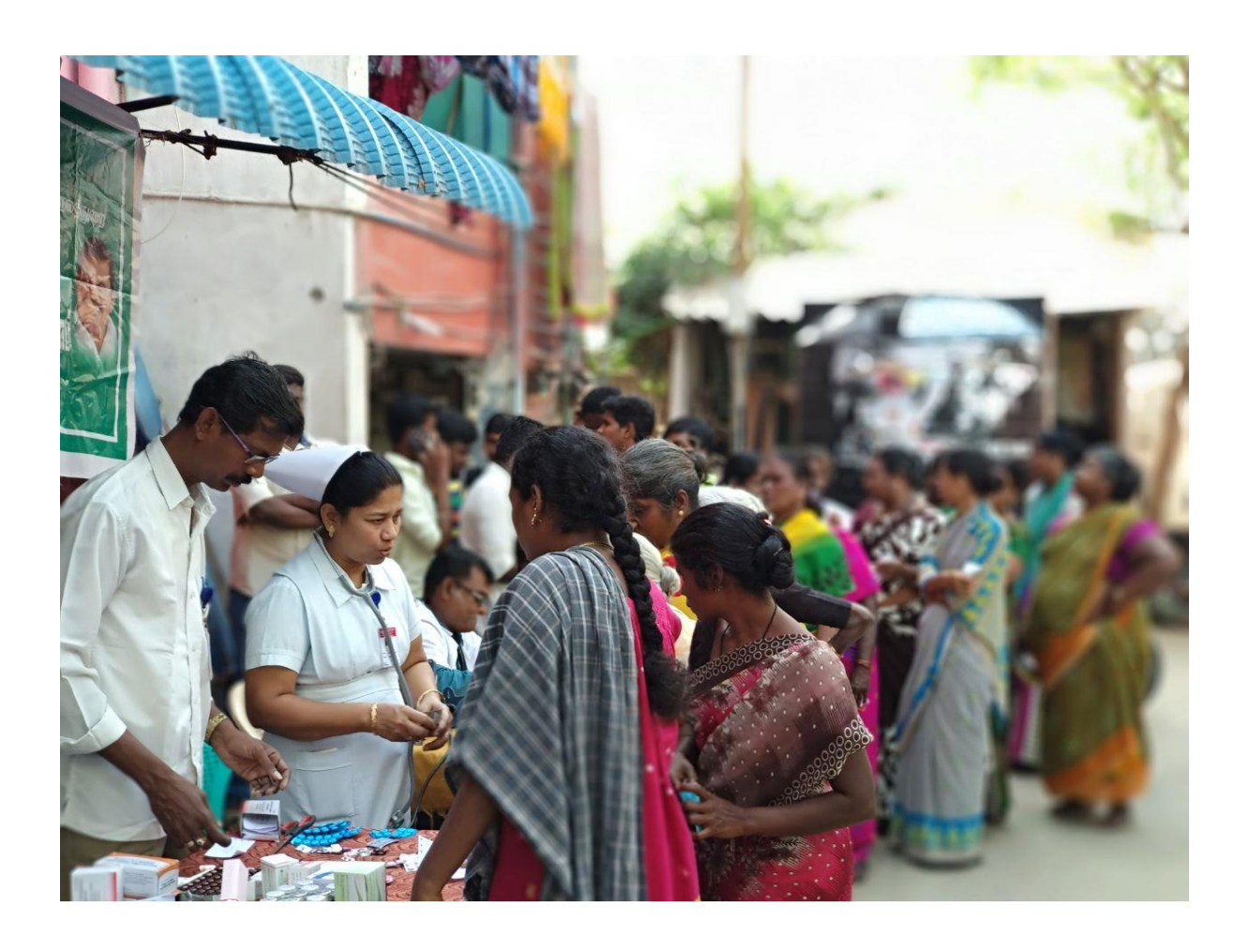
In the pic —" The Doctor from the nearby saidapet government hospital is so involved in the check up session that he himself forgot the time running and was having a great time checking the people of the area and was immensly happy that he shared his thoughts at the end of the camp and was very happy to see young bloods working so hard for the society ,and have given him the hope of a bright future for the Nation."