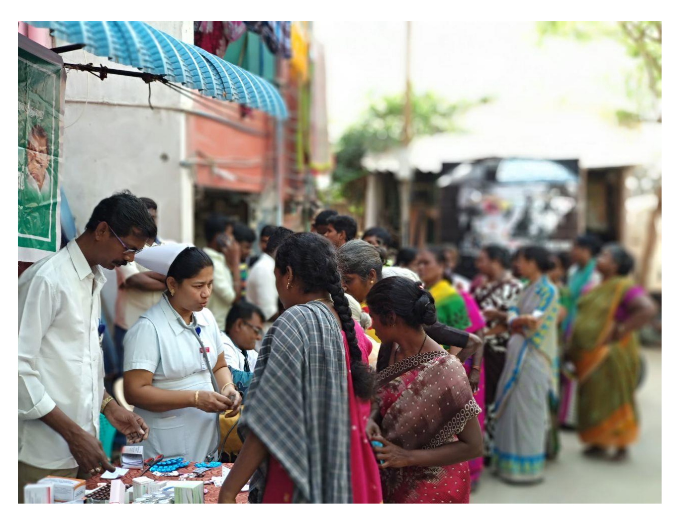
"In the above pic — we have the nurse enquiring about the health issues and the wellness of the patient and is asking the assistant to give the prescribed medicines that is required to give to the needy hosts and is ensuring that none of the person is left that needs a care of health."