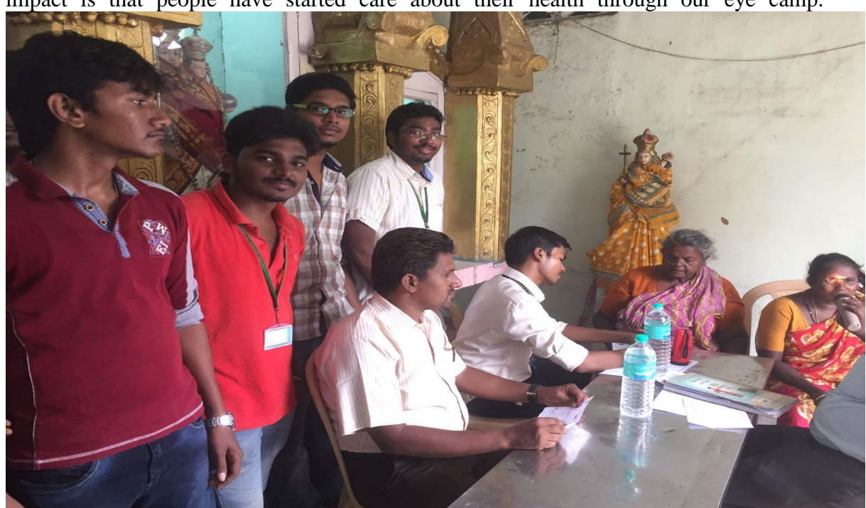
The eye camp we organized was good and we looking forward to conduct more camp like this.

Impact among public many old age peoples was given eye consultation and given free eye glasses our college was given positive view through the eye camp children with poor eyesight advice to their parent has taken proper care about their children health, main impact is that people have started care about their health through our eye camp.