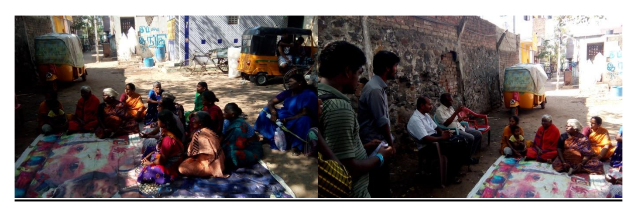
No of students who have participated in this program: 52

The students learnt skill of organising a medical camp.