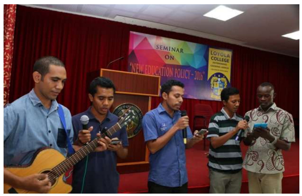
Invocation – Brothers of Berchman's Illam