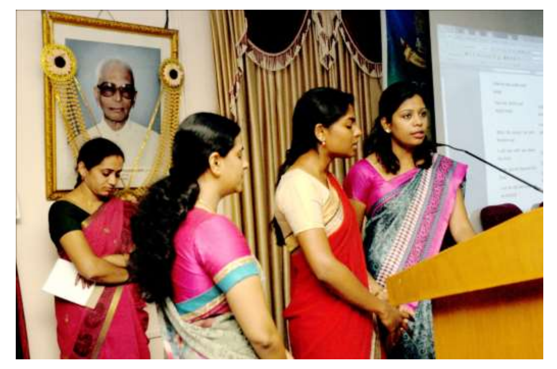
Day -2 Prayer