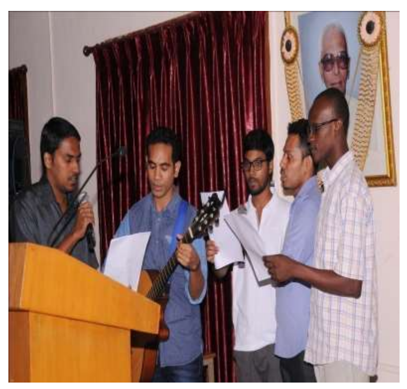
Academic Staff Orientation 14<sup>th</sup> & 15<sup>th</sup> June, 2016: