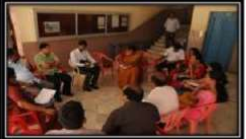
Group Discussion During General Staff orientation