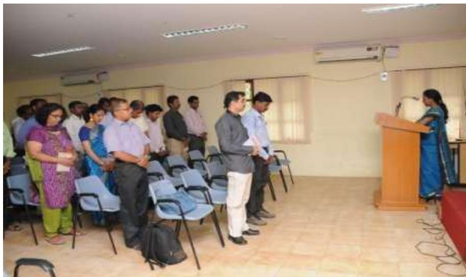
Day 1 (08.06.2015) Inauguration & Prayer