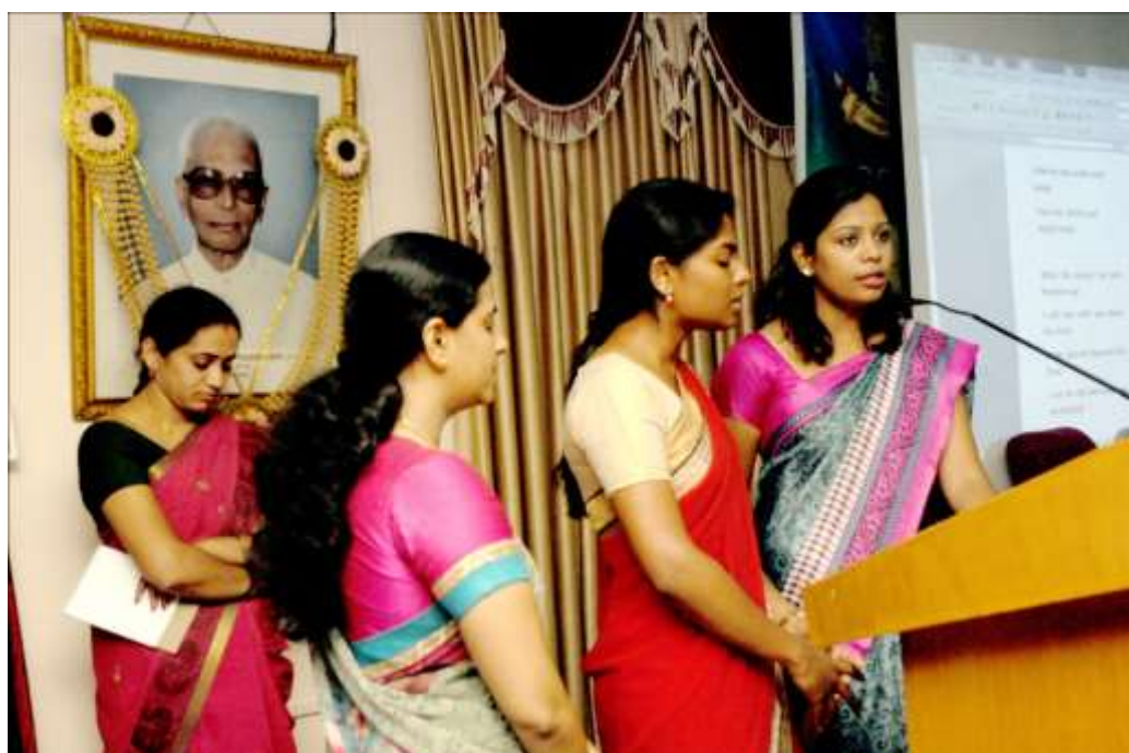
Day -2 Prayer