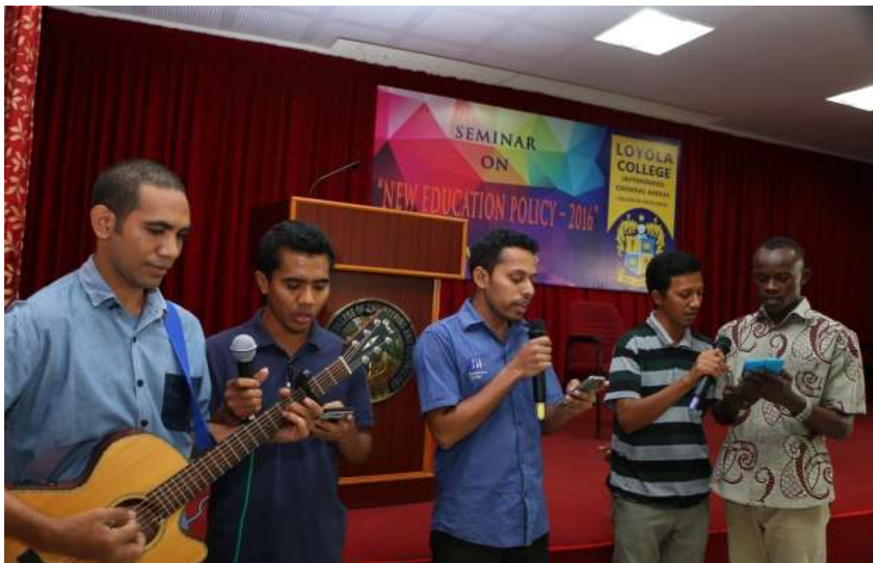
Invocation – Brothers of Berchman’s Illam