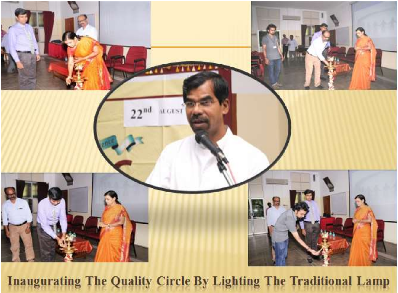
Inaugurating The Quality Circle By Lighting The Traditional Lamp