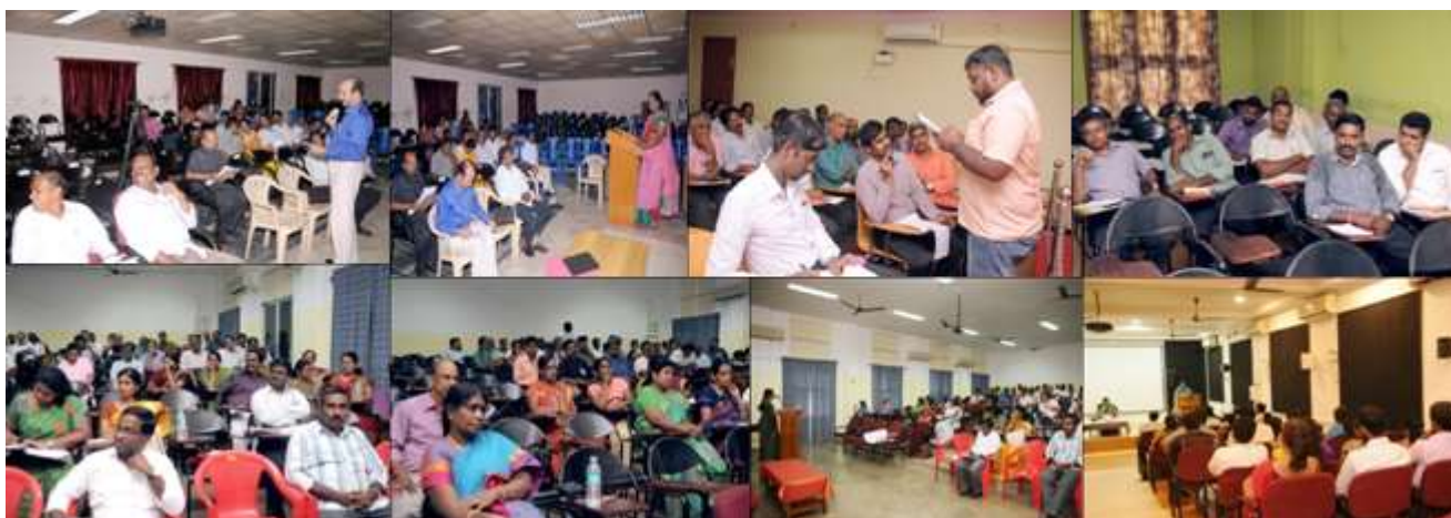
Collating the group reports for panel discussion on 15 th June,2016