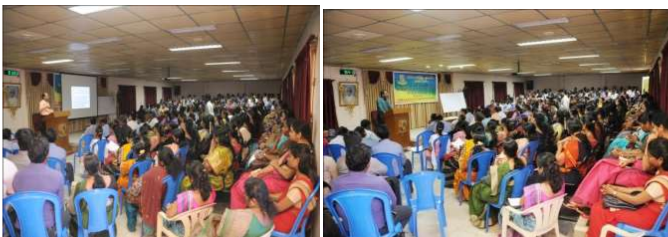
Presentation of Group Reports